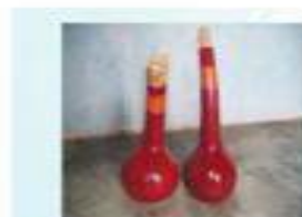
Rattle made with bottle gourd