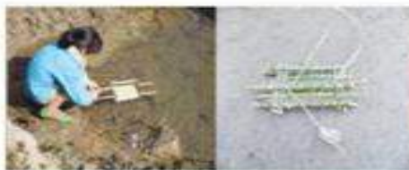
Bamboo boats in Arunachal Pradesh