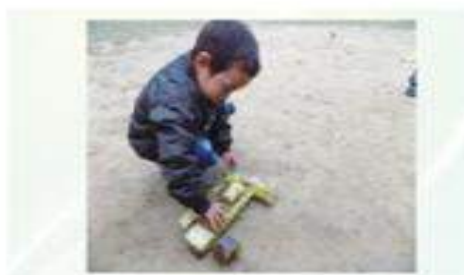
Child playing with toy car made of Banana