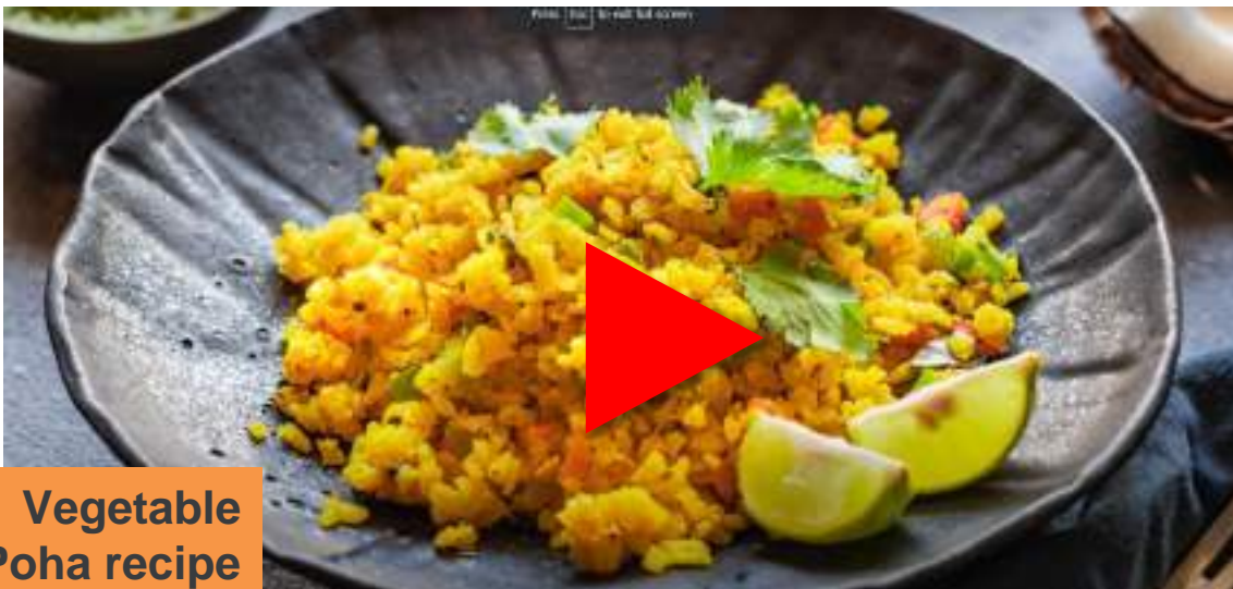
Vegetable Poha recipe