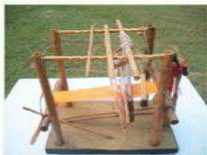
Toy loom of Assam