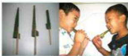
Whistle made of coconut leaf strip