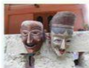
Traditional masks in Arunachal Pradesh